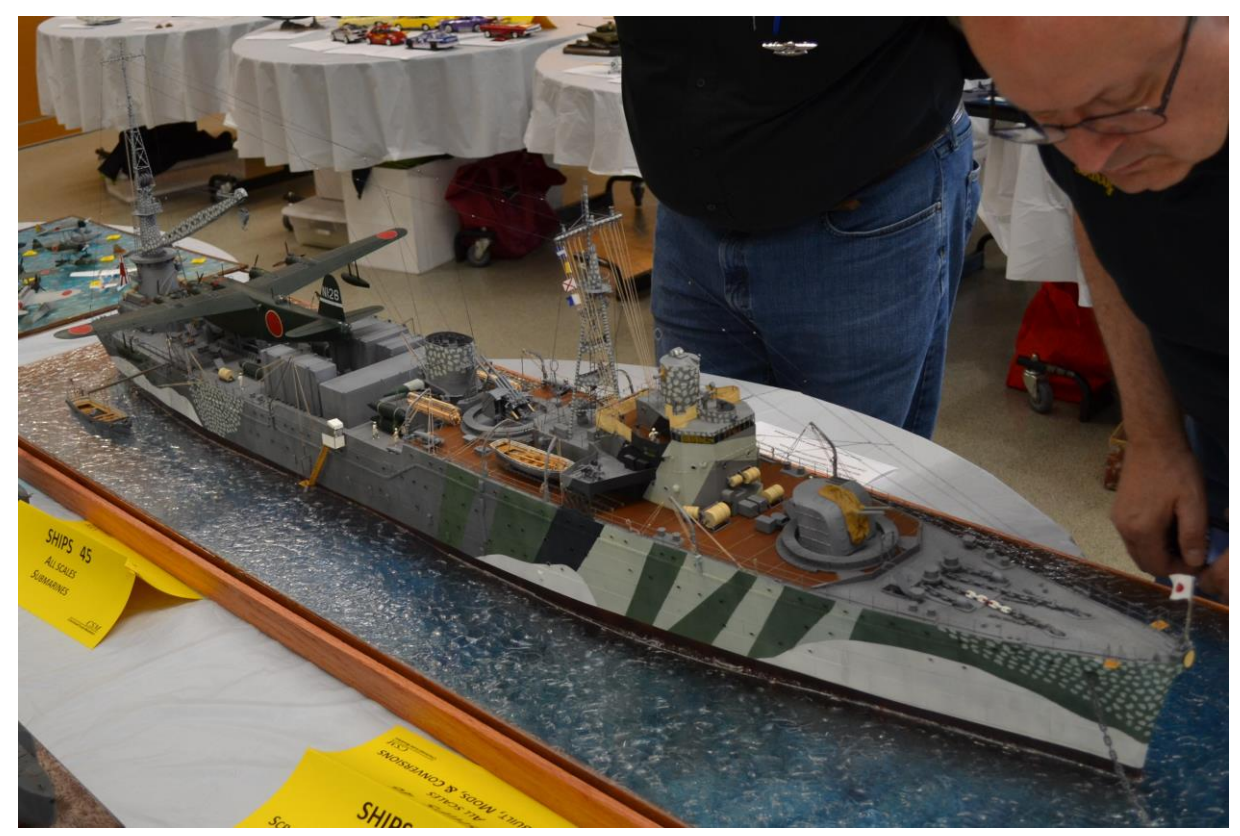
Best Ship and Best in Show

The tables on the following pages list the first, second, and third finishers by category.